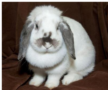
Adult Female Mini Lop

Adult males may have blocky heads. Adult females may have a dewlap (fat/fur under the chin). But some females have wide heads and some neutered males have dewlaps.