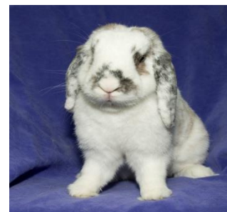
Adult Male Mini Lop